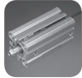
Magnetic Field Sensors