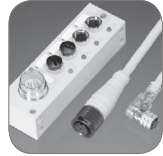
Connectors & Accessories